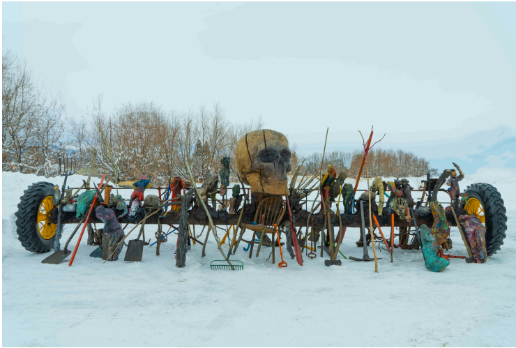
Jim Dine, The Wheatfield (Agincourt) , 2019

Field of Dreams also marks the first appearance of two bronze sculptures by Jim Dine: The Hooligan , 2019, and The Wheatfield (Agincourt) , 1989-2019. Standing at nearly nine feet tall in Parrish's Entry Meadow, The Hooligan draws inspiration from the iconic Venus de Milo. A prominent motif across Dine's media-spanning practice, the repetition and seriality of the Venus in Dine's compositions has been seen as an act of subversion, exacerbating its status as an icon. 1