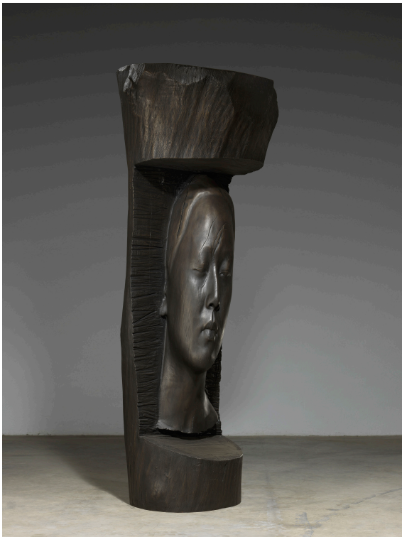
Jaume Plensa, Laura Asia (oak), 2019

CHICAGO, ILLINOIS—Gray is pleased to announce that works in sculpture and installation by Theaster Gates, Jaume Plensa and Jim Dine will debut in Field of Dreams , the Parrish Art Museum’s inaugural sculpture exhibition. The extensive outdoor installation, which responds to the landscape and architecture of the museum’s 14-acre grounds in Water Mill, New York, opens August 20, 2020, featuring ten artists of international renown.