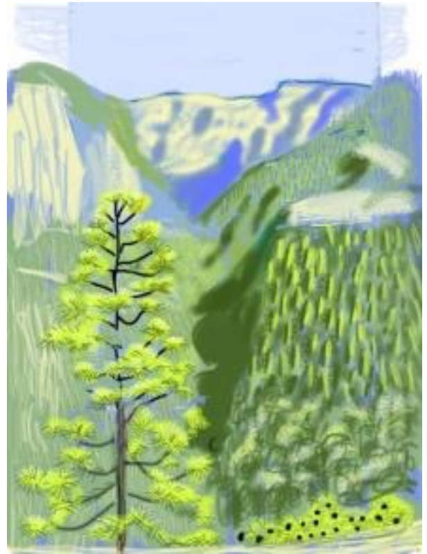
A landscape painted on David Hockney's iPad

Each image as it appears on another iPhone or laptop is virtually identical to the original, although Hockney points out that even with a manufactured item such as this, there will probably be minute differences. Even so, the drawing on my phone not only looks like the one on his, digitally and in almost every respect it is the same. This is profoundly subversive of the art market as we know it, with its focus on the signed original work.