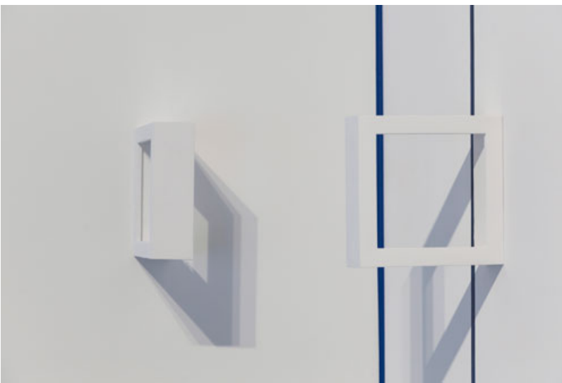
Ethan Ryman. Blue shift, 2014. Acrylic on wood with masking tape, ink marker, 18 in x 13 ft x 15 in.