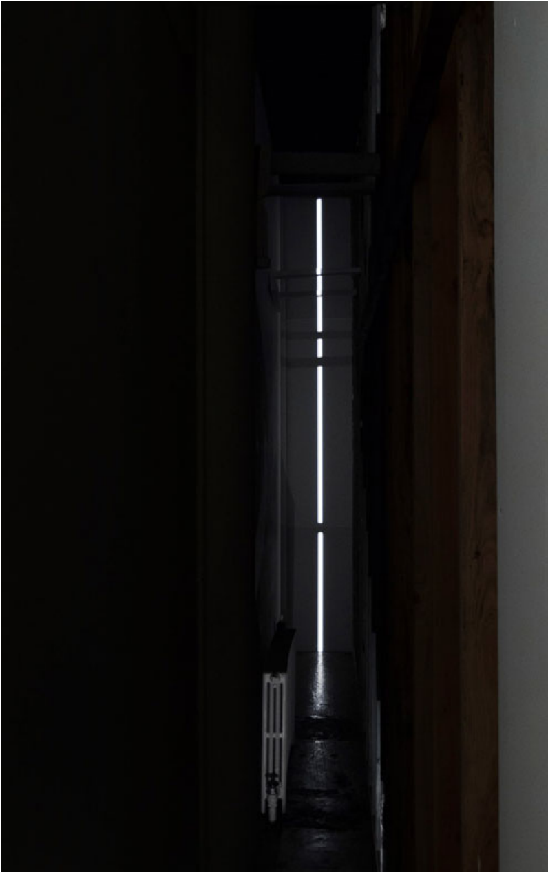
Jan Tichy. Installation no. 20 (walls), 2014 (2). Two channel video projection, site-specific.