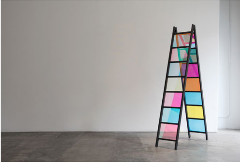
Stephen Dean. A Frame, 2013. Aluminium structure and dichroic glass, (14 panels of 11 1/4 x 14 3/4 in) 92 x 56 x 17 in.

Dean, Ryman and Tichy are poets of light, which, as curator Lilly Wei states in the press release, is their “means to comprehend and engage with the world”. It is the driving force of change – of colour diffusion, shadow and architectural space. Light, as Dean describes it, “is a great medium by itself, impalpable and ever-present”.