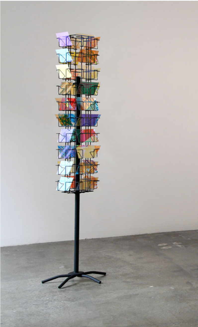
Stephen Dean. Prayer Mill, 2009. Metal structure and dichroic glass, (40 panels of 4 x 6 in) 72 x 10 in x 10 in.