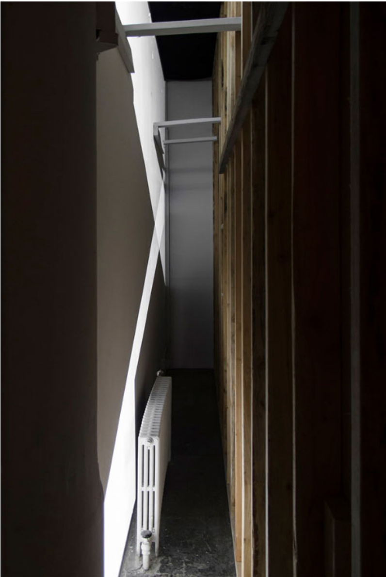
Jan Tichy. Installation no. 20 (walls), 2014 (3). Two channel video projection, site-specific.