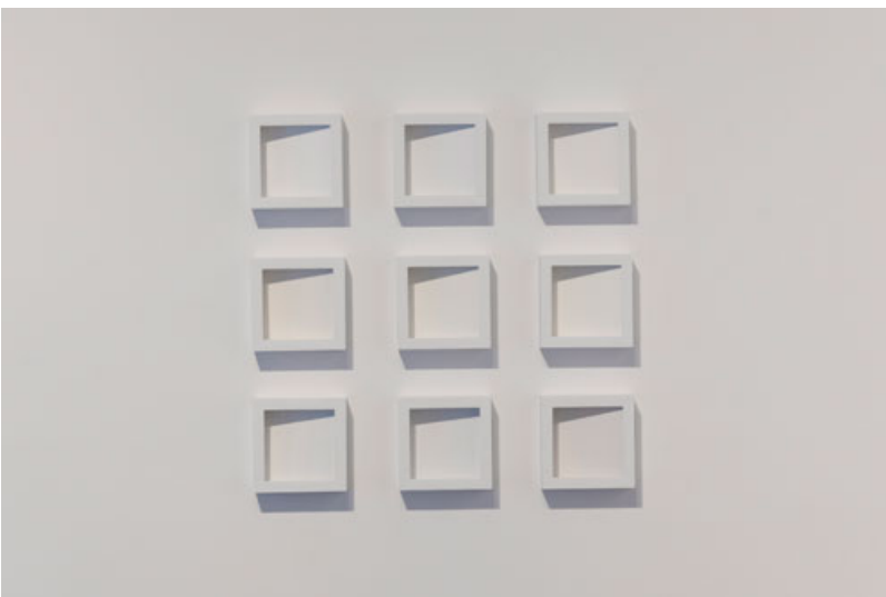
Ethan Ryman. Configuration 1, 2014. Acrylic and gesso on wood, 29 1/4 x 30 1/2 x 2 1/4 in.