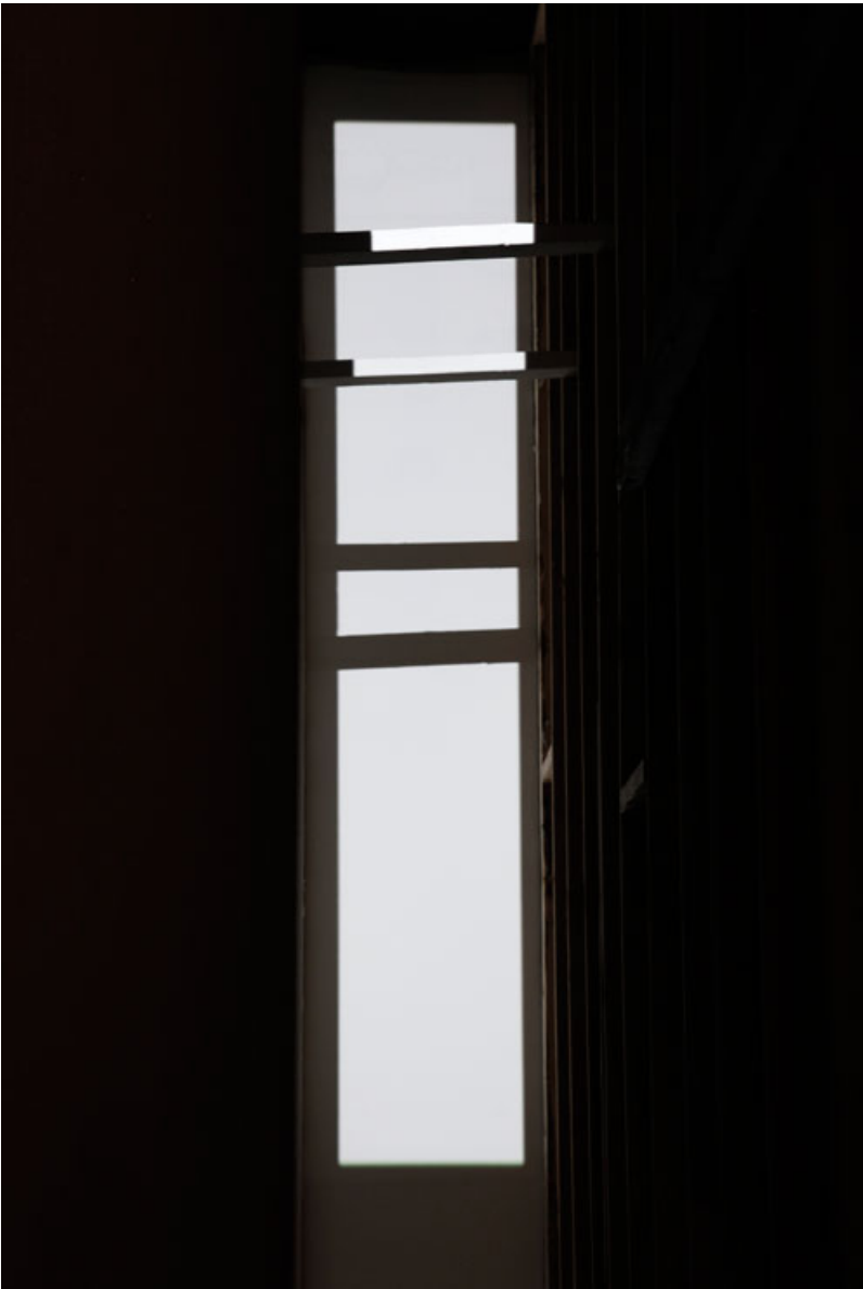
Jan Tichy. Installation no. 20 (walls), 2014. Two channel video projection, site-specific.