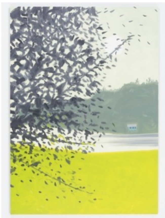
4PM, 2014. OIL ON LINEN, 144 × 108".

One night this past February, artist Alex Katz held a small, informal gathering at his SoHo studio, displaying a number of recent paintings. Among them was a monumental, blue, gray, and white landscape of winterlike trees. Another was a closely cropped portrait of a woman in a black shirt, her image repeated five times—not in the pop screen-print manner of infinite duplication but in a New Wave cinema split screen of shifting, intimate moments. (There was also a particularly attractive smaller painting of a sheepdog by the entrance.) Katz's studio, which he moved into in the late '60s, is one of those rare remaining live-work artist spaces left in the neighborhood—it hasn't been chopped up or redecorated or besieged by interior designers; it's just this charming, warm, linoleum-floored loft space that takes up its allotted section of the building. In other words, it feels more like a real room because it hasn't been obsessively overthought or reconsidered or diminished by passing fads. Katz's work isn't so different.