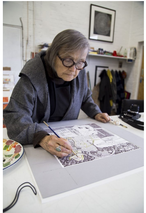
Working on her last print.

A South Side Chicago native, Ellen permanently relocated to Manhattan in the 1980s, although she often returned to