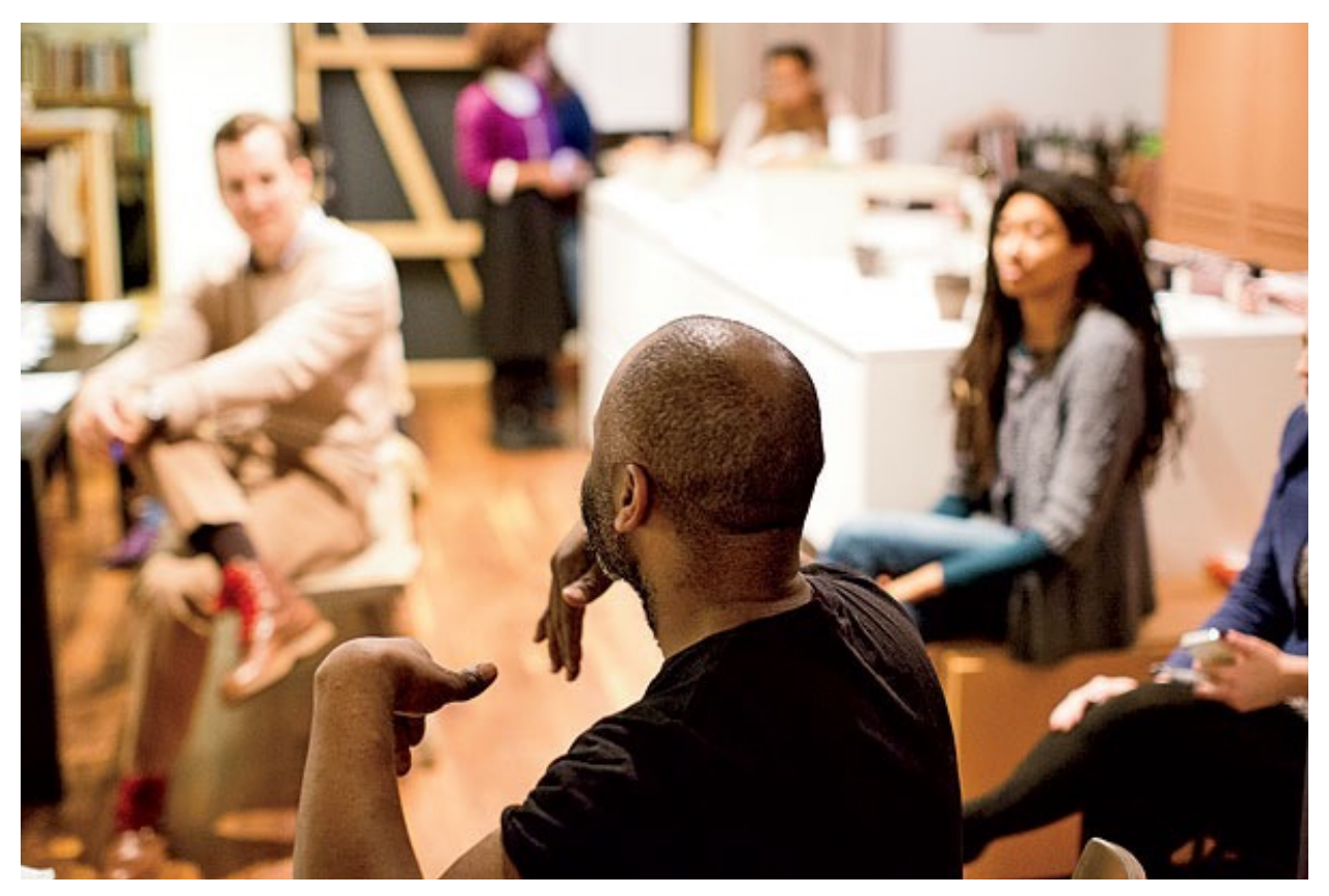
Gates rehearsing with his musicians

It wouldn't be a Gates show without performance. He and his band will appear three times, and South Side church choirs have been invited to participate. Separately, in a fourth-floor screening room, video will loop of performances from Grand Crossing and from Kassel.