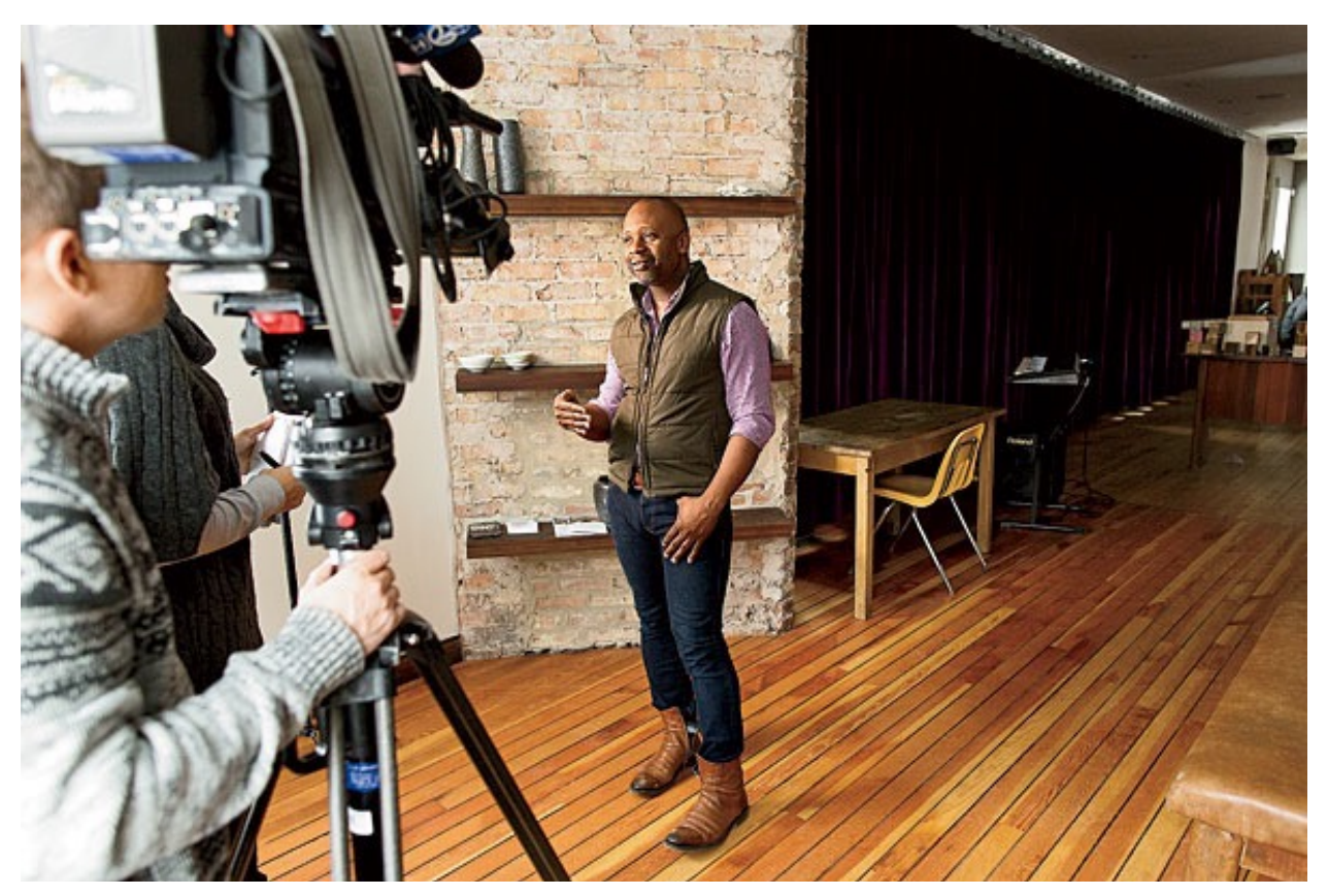
Gates being interviewed by ABC-7