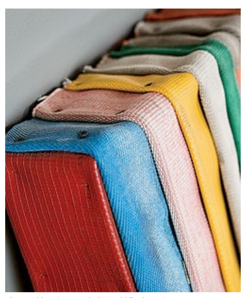
An art object (one made from old fire hoses)

Bonami wound up tapping Gates for the Biennial but didn't give him a plum spot in the main exhibition hall. Gates was placed below it, in a courtyard next to the museum's restaurant. Here an artist could be overlooked—or could seize the opportunity to transform a nontraditional space and capture the attention of a hungry audience lining up for $15 pork belly sandwiches while he was at it. Gates did the latter, reprising parts of Temple Exercises and staging several Black Monks of Mississippi performances under a light box that read "SHINE."