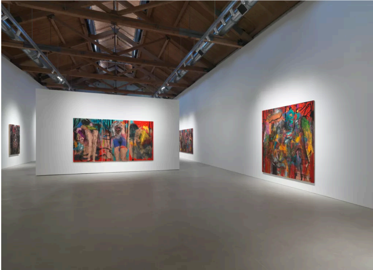
Jim Dine, Installation view of "Looking at the Present: Recent Works by Jim Dine" at Gray Warehouse, Spring 2017

There's no atelierstill here. Dine's formally and materially wide-ranging oeuvre precludes a de Kooning-like insistence on paring back the visual essentials of a life's work. But Dine is grappling with age nonetheless. While he forgoes his signature use of hearts, bathrobes or hand tools, the artist is resoundingly present in these nine large-scale works. Animating the blistering scarified surfaces and full-throated reds are the contours of Dine himself: his head and his skull.