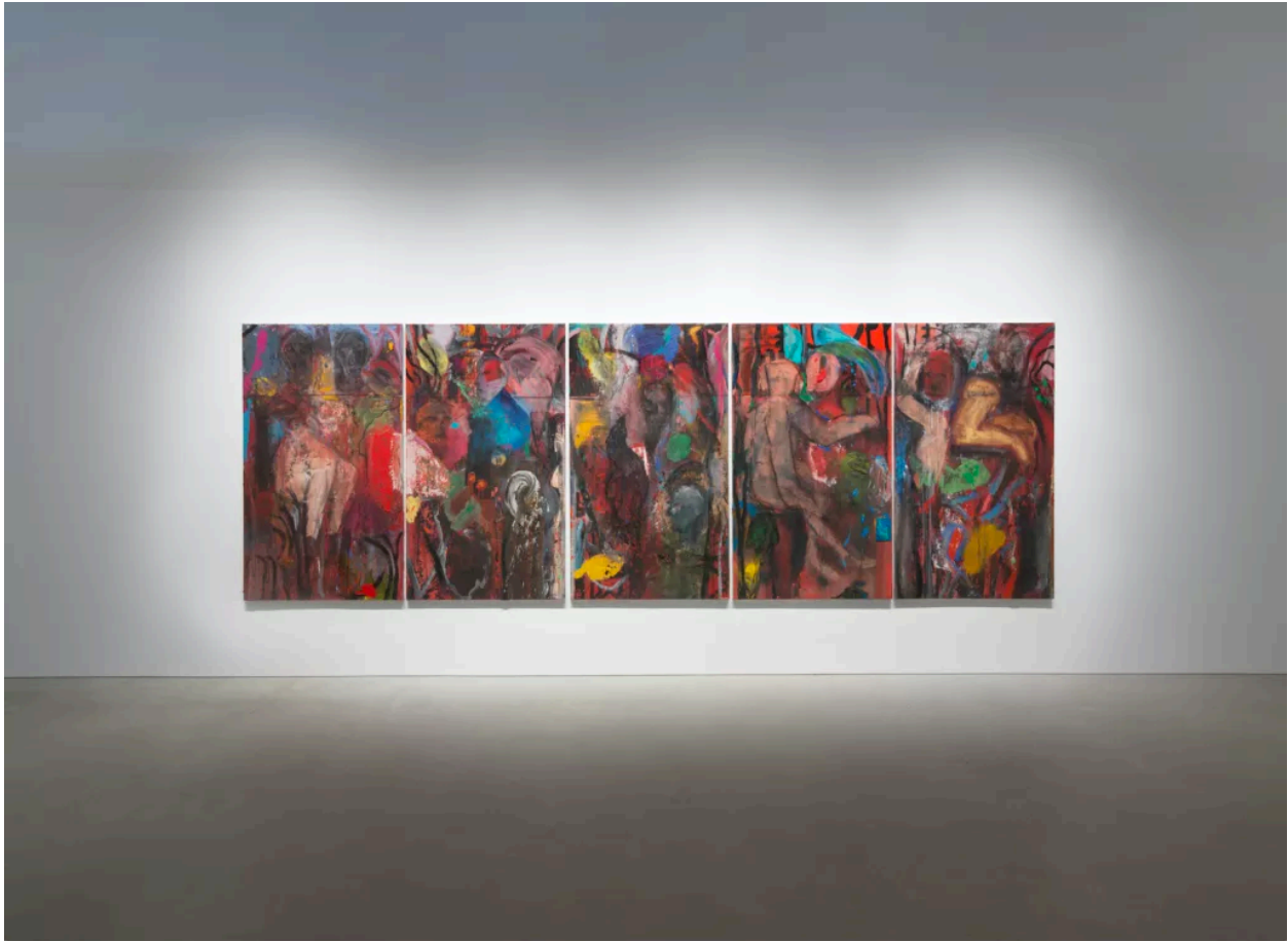
Jim Dine, Installation view of "Looking at the Present: Recent Works by Jim Dine" at Gray Warehouse, Spring 2017

Jim Dine shows through June 10 at Gray Warehouse, 2044 West Carroll.